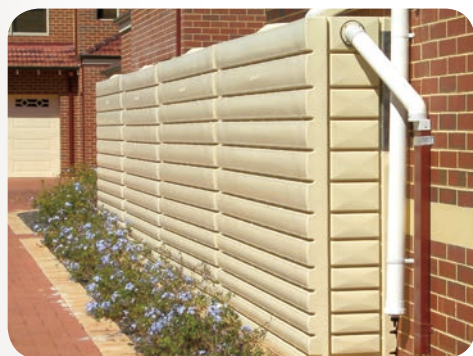
4 x 2000L tanks against a wall